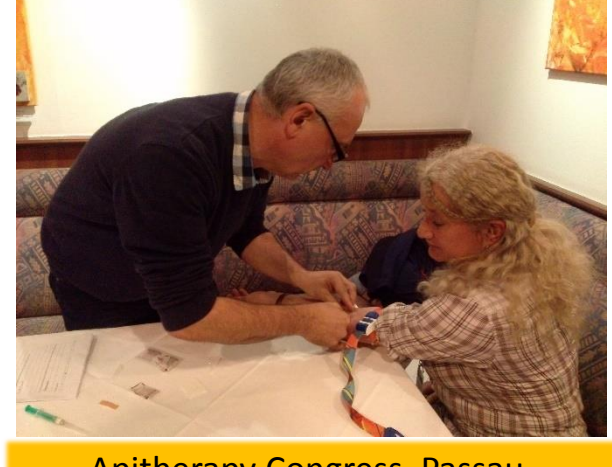
Apitherapy Congress, Passau, Germany