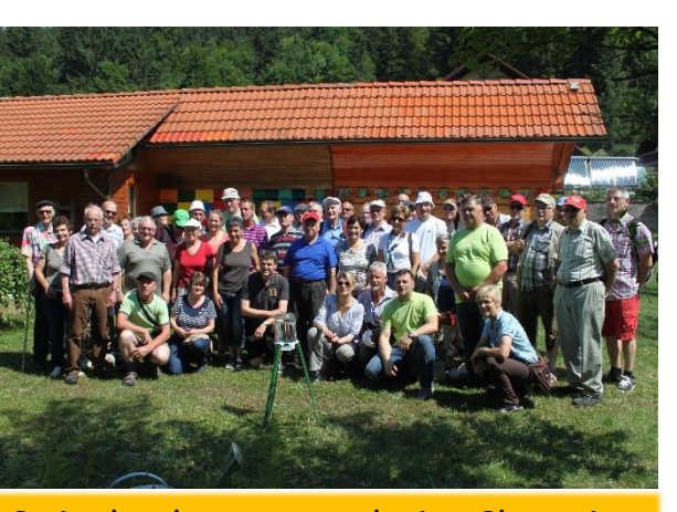
Swiss beekeepers exploring Slovenian beekeeping