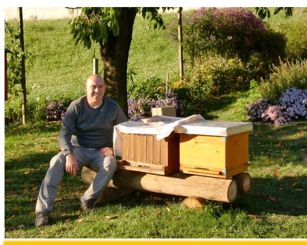
First hand apitourism experience and learning the best practices