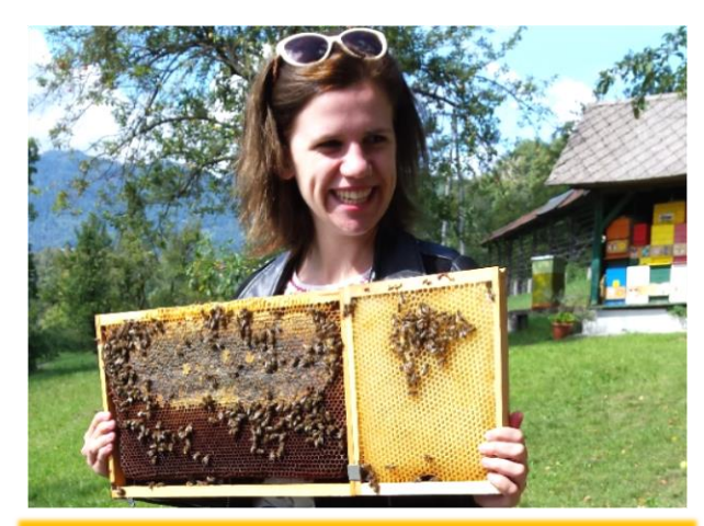
Getting to know the mystic world of bees on a press tour to Slovenia