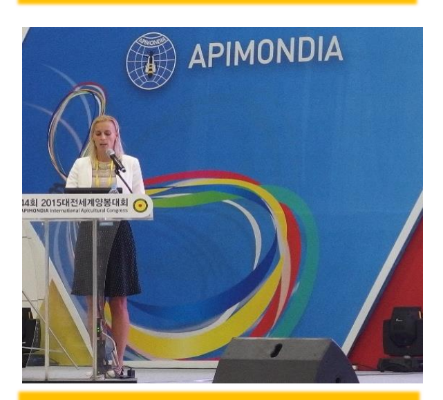
ApiRoutes at Apimondia 2015, Daejeon, South Korea