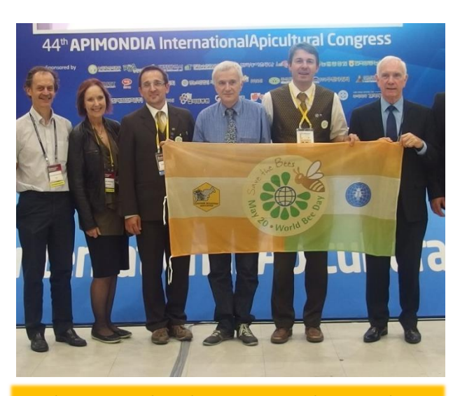
Slovenian beekeepers and Save the bees iniciative, Daejeon, South Korea