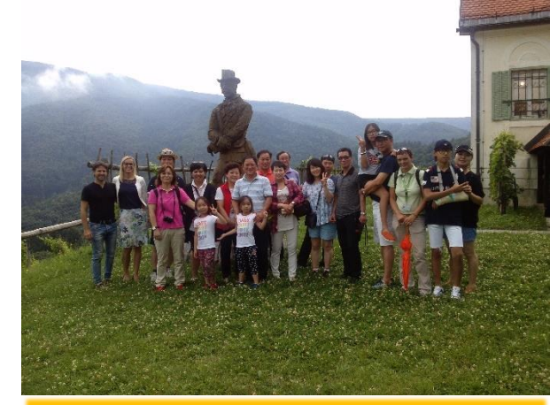
Scholars from South Korea visited Faculty for Agriculture; Maribor, Slovenia