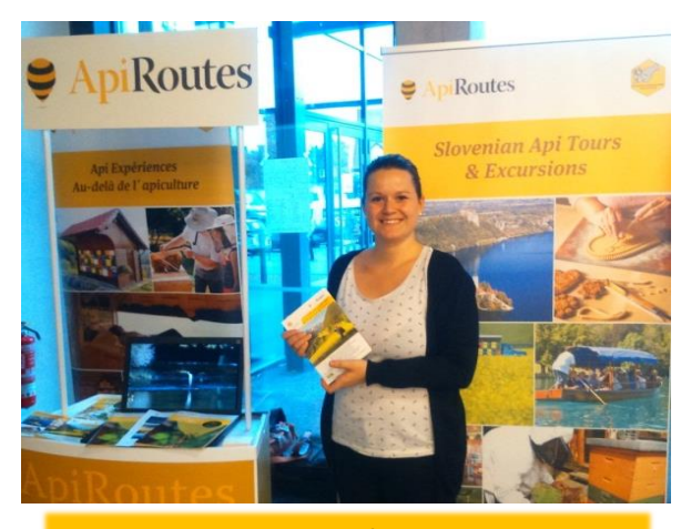
Donaueschingen, Berufsimkertage, Germany